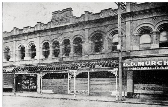
1917 – Photo of the burnt out Silver Grid showing the remains of the verandah.

Of the 26 people sleeping on the upper floor, 6 died, three of whom are buried in Linwood Cemetery - Annie SMITH [B47P316], Henry Herbert BEERE [ B46P163 ] and Ted GLEDHILL [B46P323] both tradesmen. The other three fatalities were buried in Sydenham Cemetery.